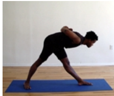
Parvotanasana Triangle Forward Bend