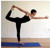
Natarajasana Nataraj pose (var)