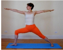
Virabhadrasana 2 Warrior 2