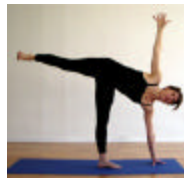
Ardha Chandrasana Half Moon