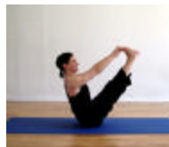
Navasana Boat Pose