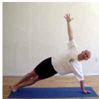
Vasisthasana Side Plank