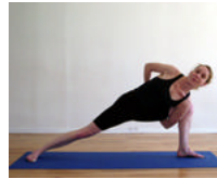
Parsvakonasana Side Angle Stretch (variation)