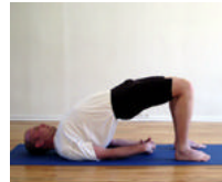
Setu Bandha Sarvangasana Bridge