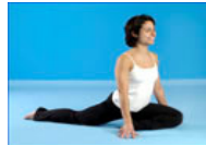
Eka Pada Raja Kapotasana