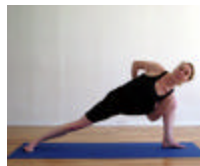
Parsvakonasana Side Angle Stretch (variation)