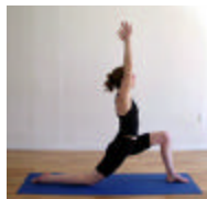
Anjaneyasana Lunge (variation)