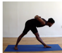
Parsvottanasana Triangle Forward Bend