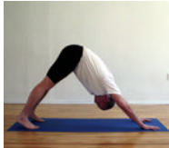
Adho Mukha Svansana Downward Dog