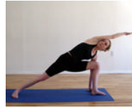
Parsvakonasana Side Angle Stretch