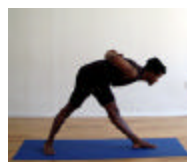
Parsvottanasana Triangle Forward Bend